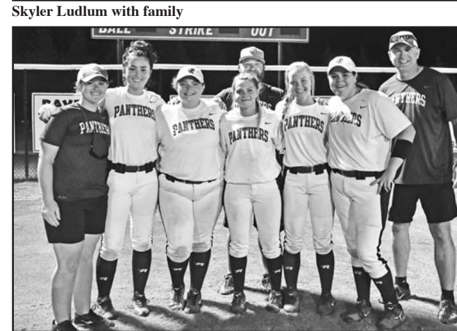
UCHS seniors with coaches